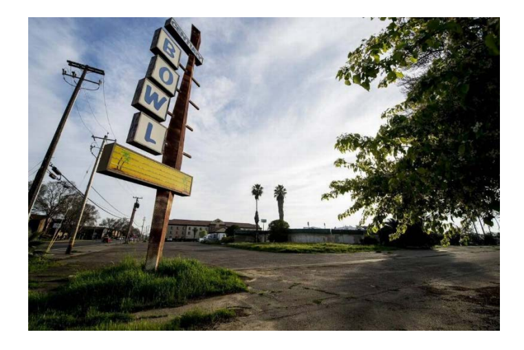
Pictured above is the Century Bowl facility prior to demolition.

It should be noted that the Century Bowl building has been demolished and the lot has been cleared to allow opportunity for future development.