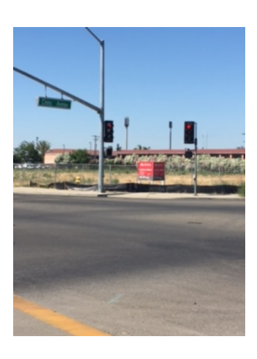
The bowling alley has been demolished and the lot has been cleared and fenced.